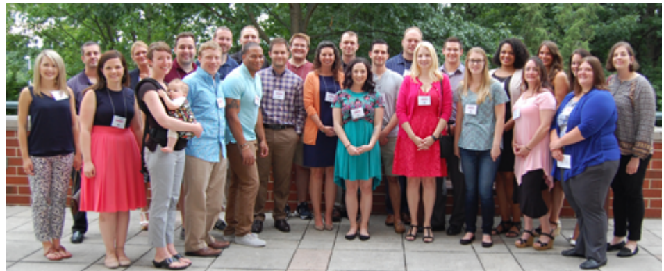
Right: New YLD admittees