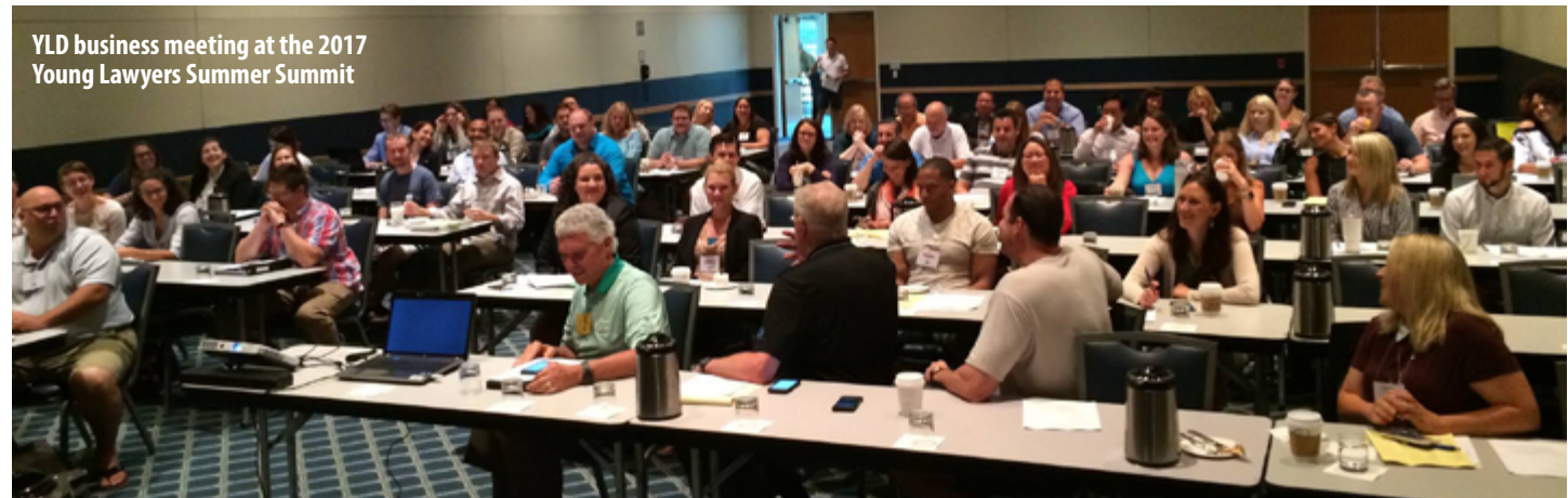
YLD business meeting at the 2017 Young Lawyers Summer Summit