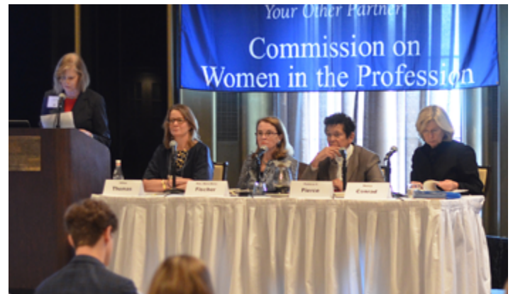
"Key Cases of the Women's Movement" panel