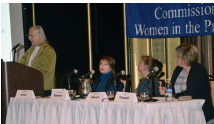
"History of the Women's Movement" panel