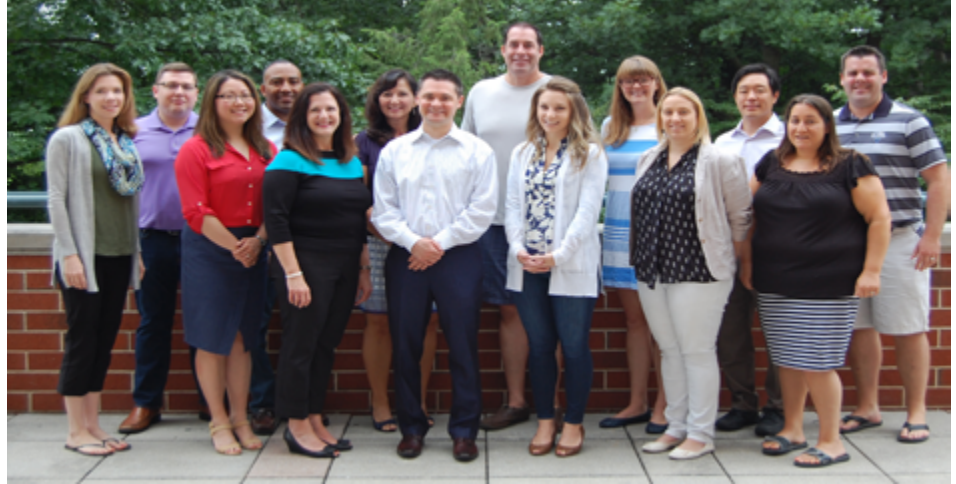
Above: The 2017 Bar Leadership Institute Class at the Young Lawyers Summer Summit

Stay tuned for announcements about ways to get involved with the PBA Mock Trial Program, legal education and the 2017-2018 BLI Class.