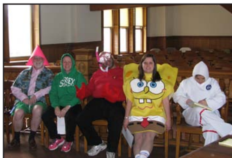
Monroe County attorneys get into character for the Fairy Tale Trials.

We would like to thank, again, the attorneys and judges who volunteered their time to participate in this year’s trials and other Law Day events.