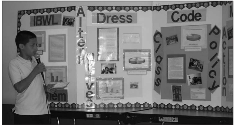
A sixth-grade student at the International Business and World Language School in Reading explains his class’s proposed policy to change the current school dress code.

“I felt it was so important for the Pennsylvania Bar Association to do our part by reaching out to schools and volunteering our time and experience to work with young students — the future voters, jurors and leaders of our communities. Civic education is something that is near and dear