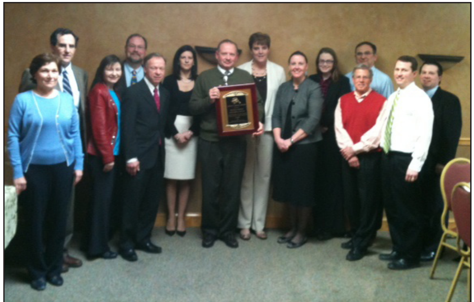
The Wayne County Bar Association (WCBA) receives the Pennsylvania Bar Association Ernico Award.