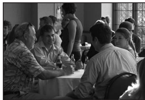
A scene from the speed networking event.