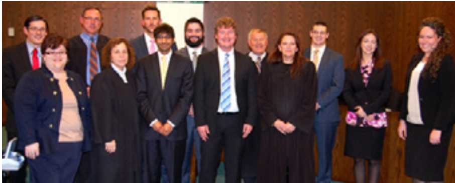
Nine new lawyers were admitted to practice in Lycoming County.