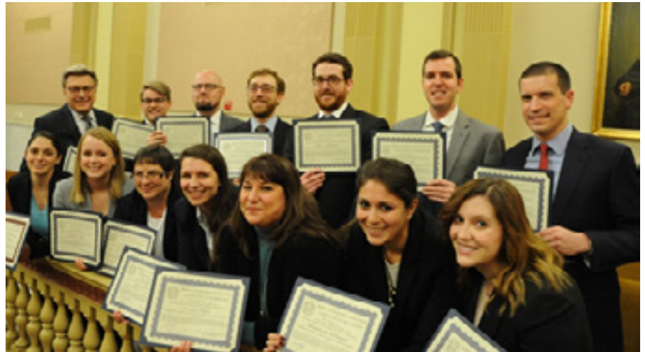
York County Bar Association new admittees

ceremony, all were invited to a welcome reception at the law offices of Katherman, Briggs and Greenburg.