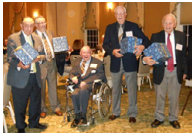
Cumberland County Bar Foundation: 60 Years of Service Honorees