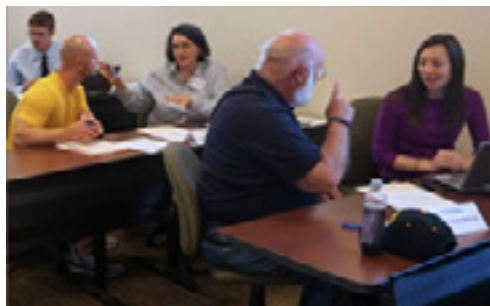
Erie County Bar Association "Wills for Heroes" event