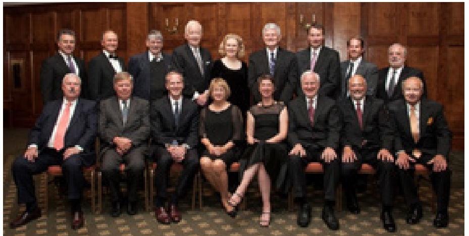
Monroe County Bar Association Centennial Celebration.