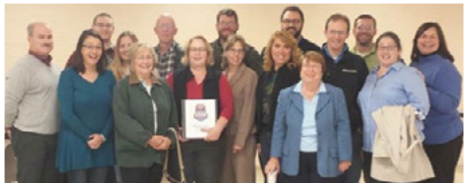
Lycoming Law Association & YLD Wills for Heroes program