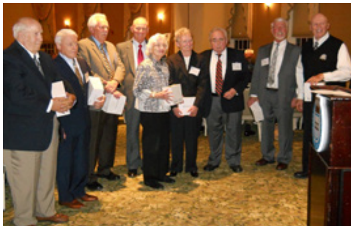
Cumberland County Bar Foundation: 50 Years of Service Honorees