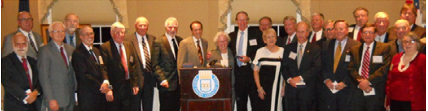
Cumberland County Bar Foundation: 40 Years of Service Honorees