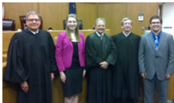
Lawrence County Law Day