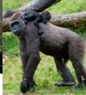
Luzerne County Bar Association Travel CLE Committee 2016 "Wildlife to Wine" Trip to Africa, Oct. 10-22, 2016. For more information, go to https://www.gate1travel.com/groups/AFR835423