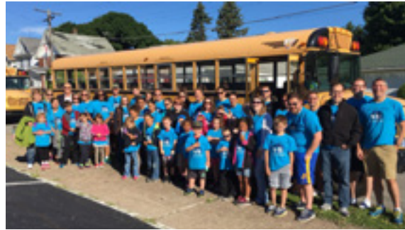
The Erie County Bar Associations' Attorneys and Kids Together (AKT) Kid Konnection program