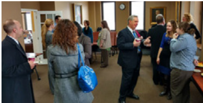
Lycoming County Court Administrator's Office Meet & Greet