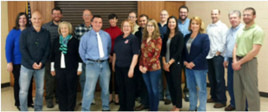
Lycoming Law Association Wills for Heroes event at Old Lycoming Township Volunteer Fire Company

Association and its members coordinated a Wills for Heroes program. During the October program, the local attorneys witnessed such an enormous need that they decided to once again donate their time and services. In addition to the attorney volunteers, there were nine volunteer notaries who also helped to provide free basic estate planning documents to 36 clients at the day-long event. This event took place at the Old Lycoming Township Volunteer Fire Company's social hall.