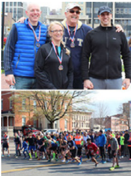
Erie County Bar Association Law Day weekend celebration 5K run/walk

The ECBA wrapped up its Law Day weekend celebration with a 5K run/walk on Saturday, April 30, with help from the Erie Runner's Club. Runners and walkers of various ages and experience participated in the event, which benefits the ECBA's Attorneys and Kids Together Program. The AKT program supports the educational needs of local students living in homeless situations, and a donation from the 5K proceeds is also made to the Erie Runners Club Scholarship Fund in appreciation of the group's support for the race. This year's Law Day 5K raised $11,250 for AKT, bringing a cumulative total from the past 13 years to $154,330!