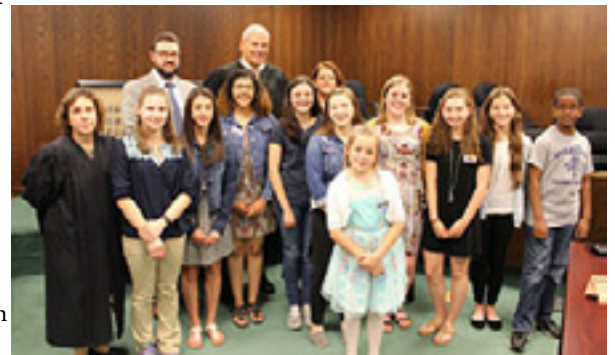
Lycoming County Law Day