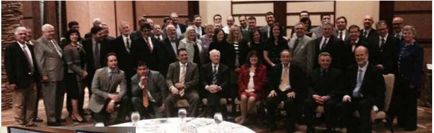
Fayette County Bar Association held its annual Bar Banquet on April 17 at Nemaquin Woodlands Resort's Horizon Point. A memorabilia table included programs from past banquets.