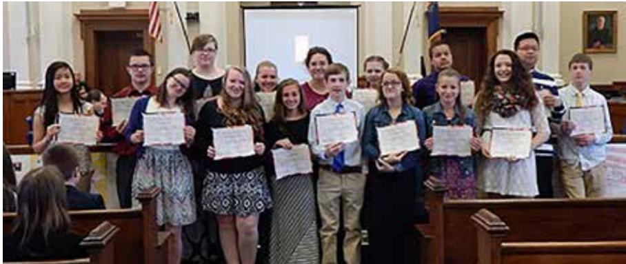
Franklin County students participated in a Law Day 2015 poster contest with the theme "Magna Carta – Symbol of Freedom under Law."