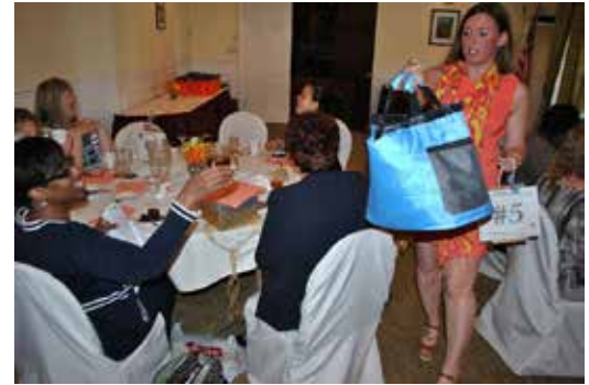
Monroe County Bar Association's annual Support Staff Appreciation Day.

Members of the Northampton County Bar Association attended the investiture ceremony of one of their own, the Hon-