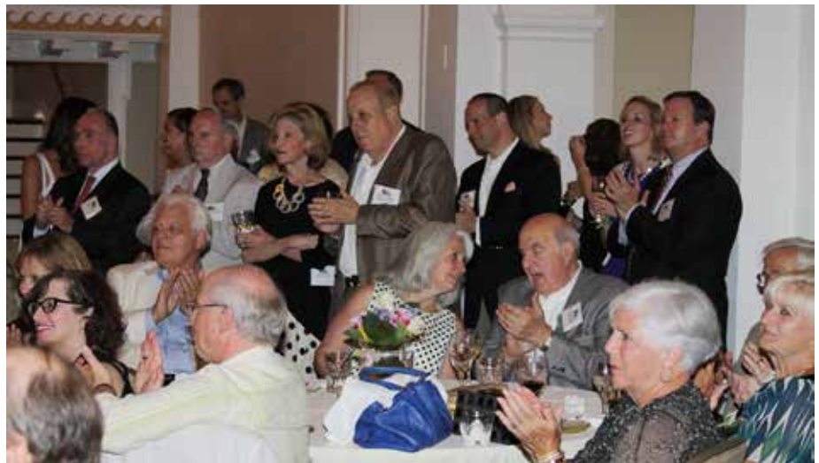
Hundreds of Montgomery Bar Association members and guests turned out to celebrate the accomplishments of MBA members serving statewide leadership positions in 2015.