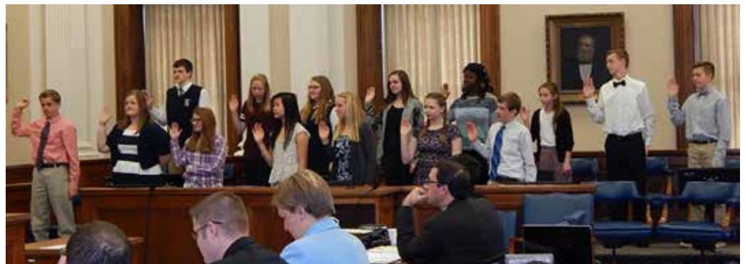
The Young Lawyers Division of the Franklin County Bar Association celebrated Law Day with a mock trial. Franklin County students served as the jury.