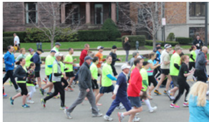
Law Day 5K: Erie County Bar Association's annual 5K will be held on April 25 to benefit Erie's homeless students.