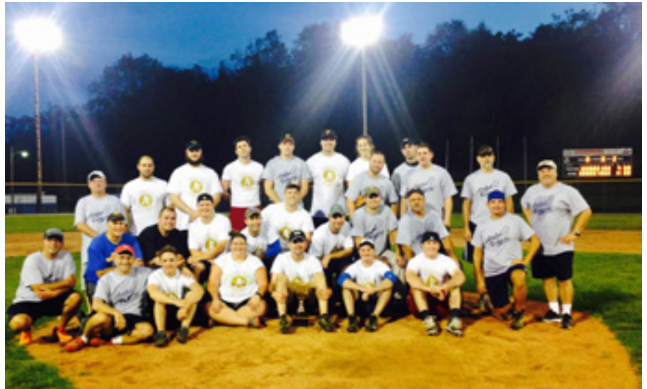
Washington County Bar Association's 18th annual Softball Challenge of Modern Times was held Sept. 11 at the Lew Hays PONY Field.

uled to end after seven innings. However, with the senior bar down two runs at the top of the seventh, the senior bar was granted an extension to nine innings. The score was tied 9-9 in the eighth, with the YLD pulling ahead for the win in the ninth inning. The game was followed by a family picnic, with 100 in attendance. Each team designated a charity and collected donations, with all monies to go to the winning team's charity.