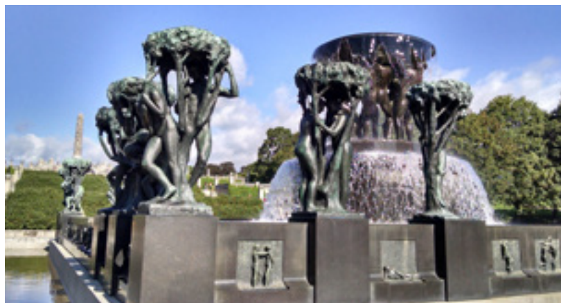
Luzerne County Bar Association's trip to Scandinavia: Sculpture Park in Stockholm, Sweden.