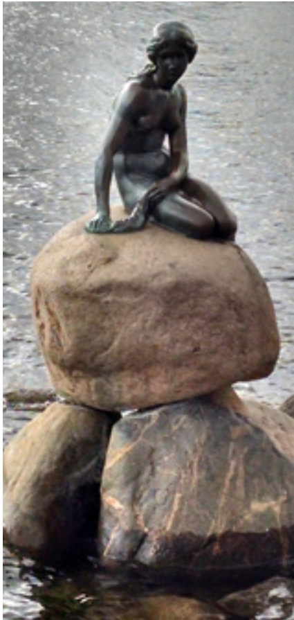
Luzerne County Bar Association's trip to Scandinavia: Little Mermaid, Copenhagen, Denmark.