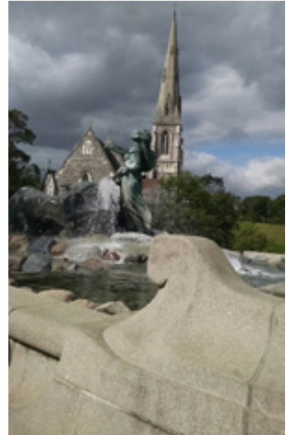
Stockholm, Sweden was among the destinations of Luzerne County Bar Association's trip.

This committee took its inaugural trip to Cuba last year, returning to give their members a one-hour CLE program that was well received. This year, the members who traveled to Scandinavia will provide another one-hour CLE session at the Association's Annual Bench-Bar conference. Approximately 350 members are expected to attend. This year's conference will be held on Thursday, Nov. 5 at the Mohegan Sun Conference Center. The Scandinavian topics will include the Nobel Peace Prize; WWII; taxation control issues; and security matters. Approximately 1,200 photographs will be played on a large screen during the presentation. In addition to this committee's session, the pro-