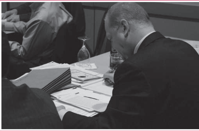
CLE programs were not only informative, but also interesting!