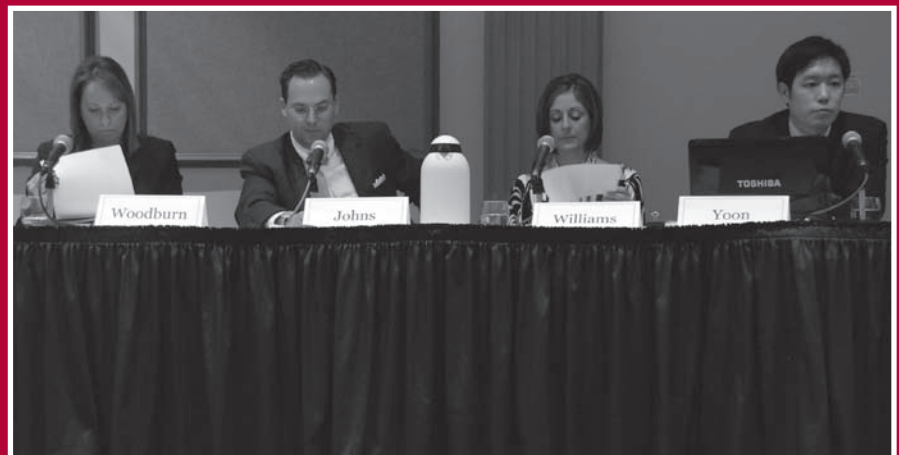
"The Future of Electronic Filing and Technology in the Courtroom" CLE panel.