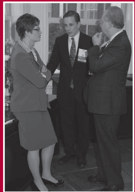
The Atrium was a popular spot for networking throughout the conference.