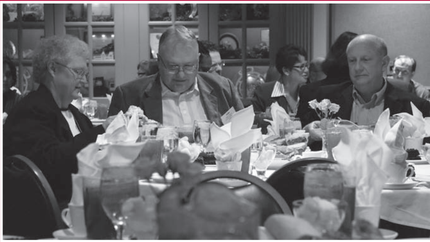
The luncheon provided an opportunity to sit down and catch up with friends in the middle of a day packed with CLE courses.