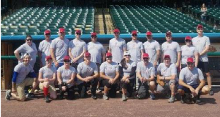
The Inaugural War of the Roses softball game - Lancaster Bar Association Lions vs. York County Bar Association Batting Barristers – raised over $6,000 for access to justice programs.