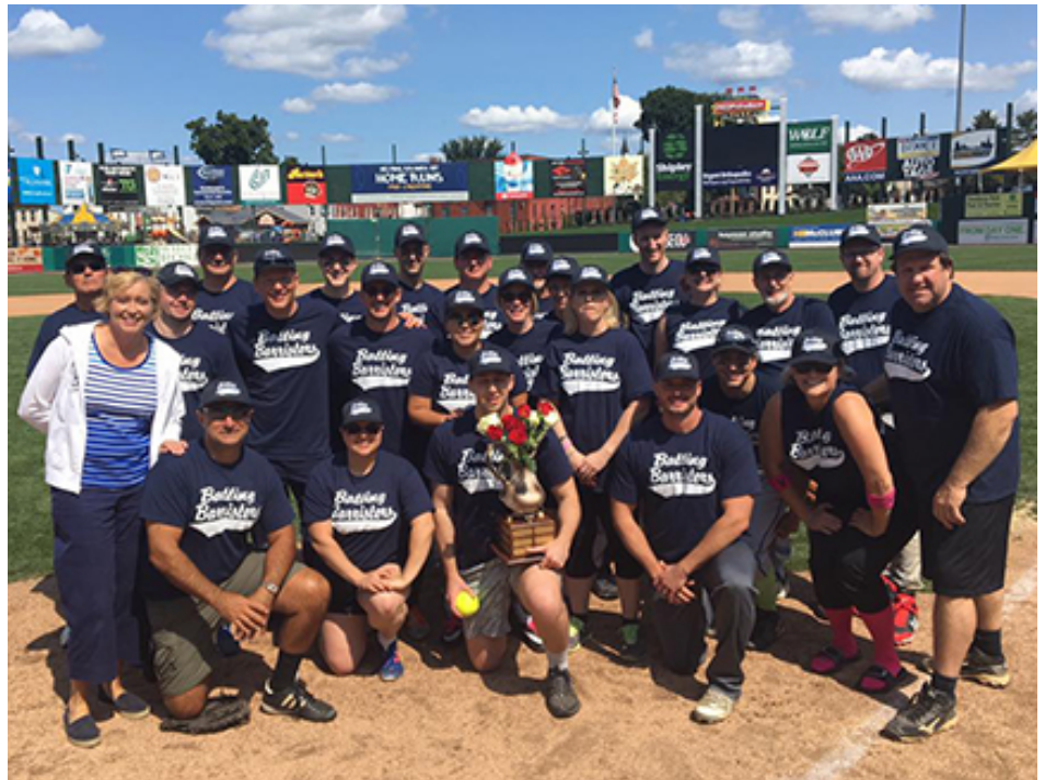
The 2017 Batting Barristers of York and Lancaster County bar associations

It was a beautiful day at Peoples Bank Park on Sunday, Sept. 10 for the inaugural War of the Roses Charity Softball Game between the Lancaster and York County Bar Associations.