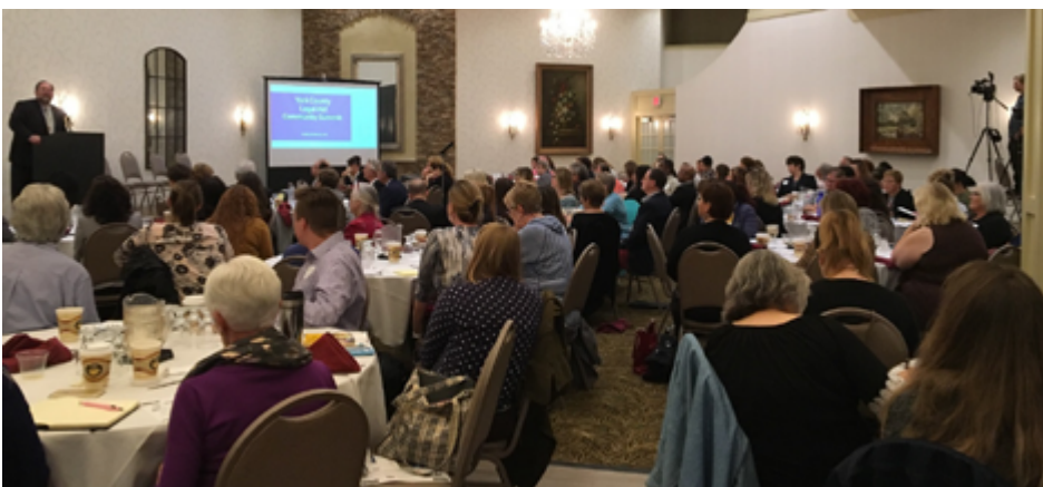
Representatives of the York County Bar Foundation, MidPenn Legal Services, ACCESS-York, the Pennsylvania Immigration Resource Center, the York County Court Self-Help & Law Resource Center, and PA 2-1-1, presented overviews of available services.