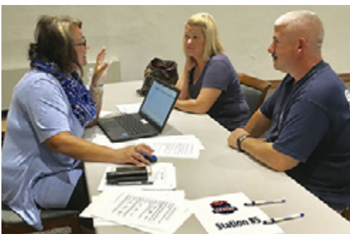
Above and right: Mercer County Bar Association's YLD held its first Wills for Heroes event.

immediate and substantial impact. Serendipitously, representatives of Your Way Home (YWH), Montgomery County's coordinated housing crisis response system for those experiencing homelessness, had reached out to Legal Aid of Southeastern Pennsylvania (LASP), seeking connections within our legal community to assist in launching a same-day court/legal service program, which had proven to be effective in other markets. Stemming from this was the formation of the Eviction Prevention and Intervention Coalition (EPIC):