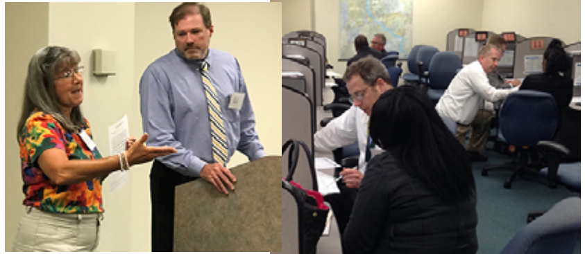
Dauphin County Bar Association conducted another Driver's License Restoration Clinic. Eleven attorneys assisted more than 50 people.