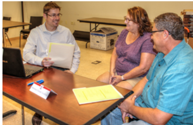
Left: Erie County Bar Association hosted its fourth annual Wills for Heroes program on Oct. 7.