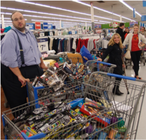
NCBA Santa is heading to the checkout.

National Museum of Industrial History, which was new and different for members. The museum is associated with the Smithsonian Institute and showcases some of the Industrial Revolution exhibits and steel production in particular.