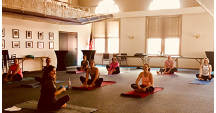
The Lancaster Bar Association is pleased to offer a new wellness opportunity – lunchtime yoga.