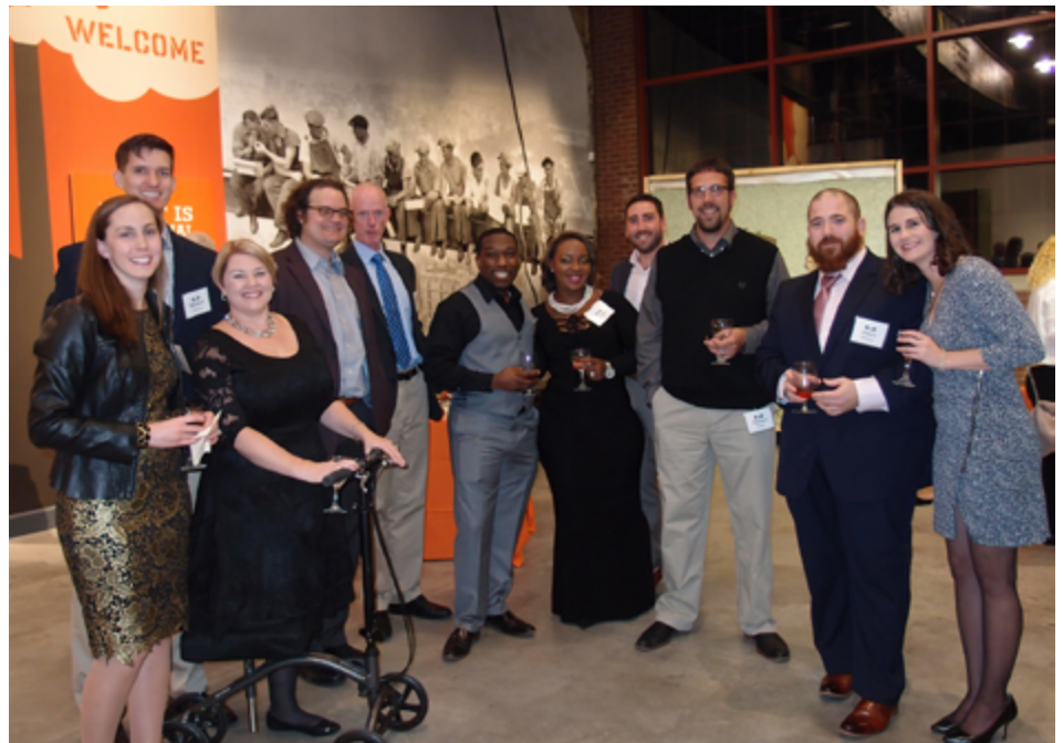
NCBA Members at the Amicus Soirée

The fall season was a busy one in Easton. The Northampton County Bar Association organized and participated in the annual Holiday Hope Chest project (631 boxes donated to children across the Lehigh Valley), the Miracle League Trick-or-Treat event with the theme of "Harry Potter," and its Annual Donut Day event to celebrate members on Love Your Lawyer Day. The young lawyers participated in a "Deep South" cooking course. The NCBA presented the "People's Law School" again through the Northampton Community College and received some of its best reviews for its members/faculty. The NCBA held its "Amicus Soirée" at the