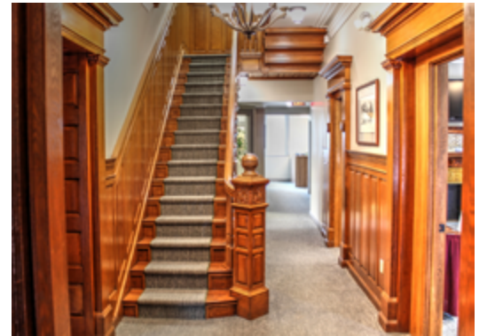
Above: Erie County Bar Association relocated its headquarters to the city's historic district.