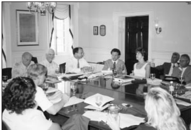
Members of the PBA Task Force on Quality of Life/Balance met on June 28 to define the issues that make law practice stressful and the tools that can be provided to help members and county bars deal with those issues.

During the meeting, task force members used their personal experiences as lawyers to brainstorm ways to balance their lives and concluded that their largest challenge would be to get lawyers to reassess their values and priorities. They agreed that lawyers workloads have dramatically increased over the years and many demands are placed on their time, leav-