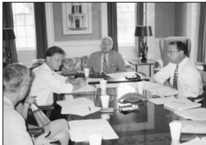
The Subcommittee met June 28 at PBA Headquarters to plan the details of Constitution Week, which will take place Sept. 13-17.

The PBA is working with the Pennsylvania Department of Education and county bar associations on a special public signing program that will be broadcast live over the Internet from Harrisburg. Pennsylvania's Secretary of Education and over 20,000 students from 69 schools across Pennsylvania will be part of the Constitution signing event through a webcast on the PBA web site, which will be run by Pennsylvania students.