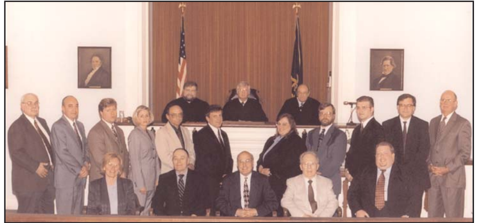
Members (all but four) of the Bedford County Bar Association pose recently with the county's two judges and one senior judge.