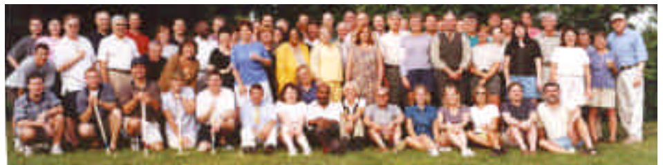
Dauphin County Bar Association members and their families gathered for their annual picnic in Harrisburg on July 27.