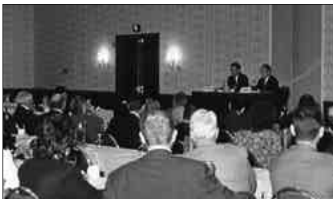
At left, an attentive crowd of PBA members listens to remarks by the attorney general candidates