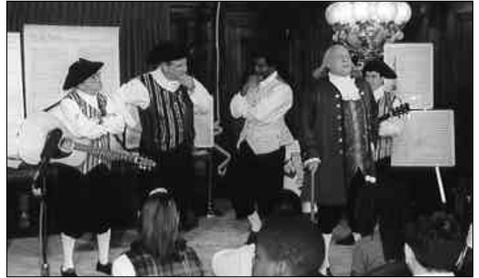
The "Four Little Pages" perform a musical explanation of the founding and writing of the Constitution during the 1999 PBA "I Signed the Constitution" program