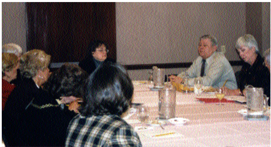
Pennsylvania Association of Bar Executives members meet in Harrisburg Dec. 1.