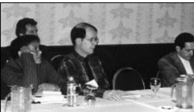
These CCBL members participate in one of the seminar's many well-attended and useful sessions.