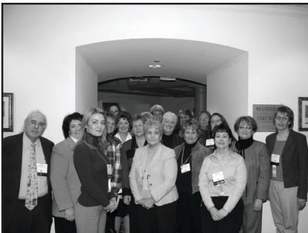
Some of the bar executives attending the CCBL break from the full schedule for a group photo.