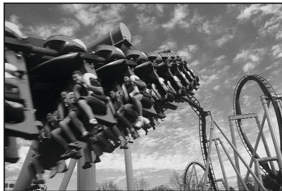
Hersheypark's Famous "Great Bear" Coaster

The new Reese's Xtreme Cup Challenge is the first interactive dark ride to pit car against car in a high-energy scorefest. Two vehicles with competing teams travel through a series of exciting competition zones. Hang onto your laser blasters and take aim at the targets as you swoop, climb, and dip through the action. Accumulate as many points for your team as